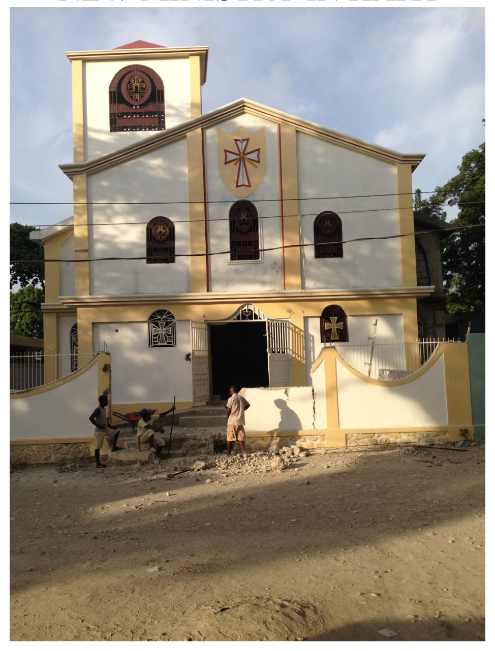
Paroisse Saint Thomas (The Parish of Saint Thomas) 464 Rue Jérusalem, Arcahaie, Haiti